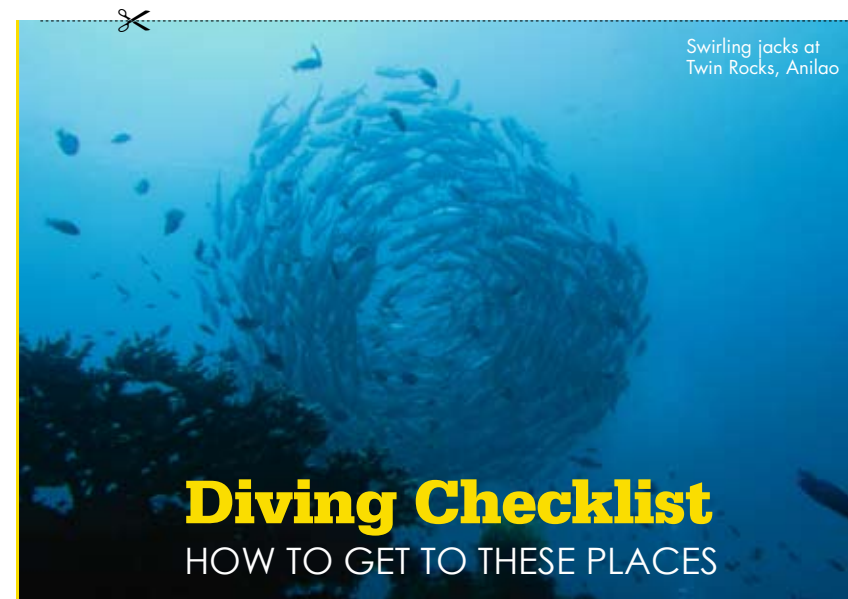
Swirling jacks at Twin Rocks, Anilao