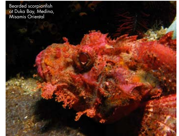
Bearded scorpionfish at Duka Bay, Medina, Misamis Oriental