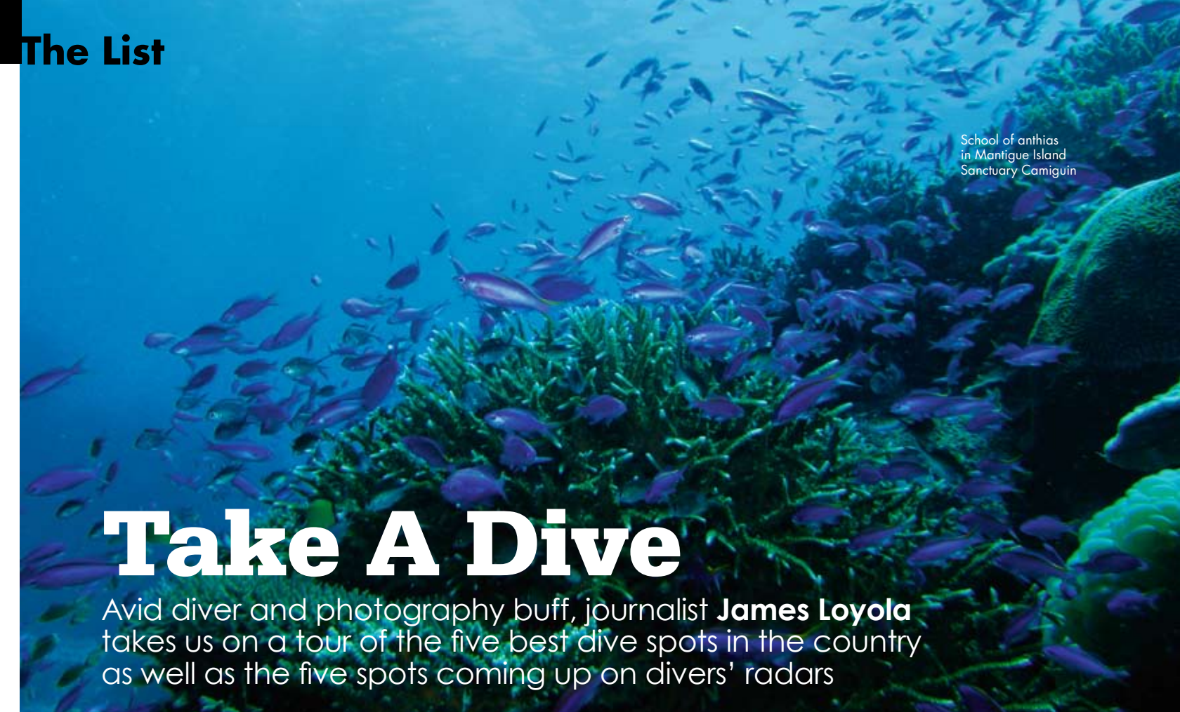
School of anthias in Mantigue Island Sanctuary Camiguin