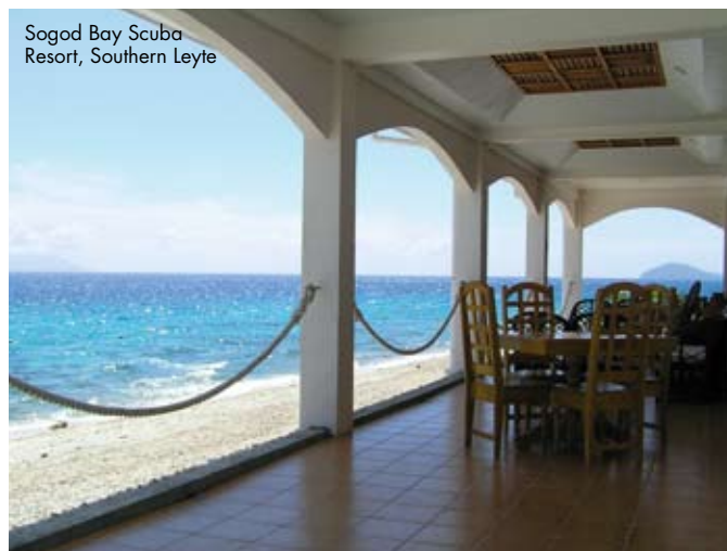
Sogod Bay Scuba Resort, Southern Leyte

4. Sogod Bay (Leyte) Sogod Bay in Southern Leyte is popular with foreign divers and recently with local divers as it offers good chances of swimming with whalesharks. Sightings are seasonal but Sogod Bay offers superb year-round diving in its pristine reefs, which have bountiful corals that are home to big fishes such as jacks, sweetlips, and snappers, as well as rare sea moths, pygmy seahorses, nudibranchs, and clown frogfishes. Among the best sites is off Padre Burgos Pier, which yields lots of interesting creatures during night dives.