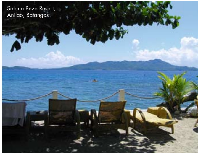
Solana Bezo Resort, Anilao, Batangas