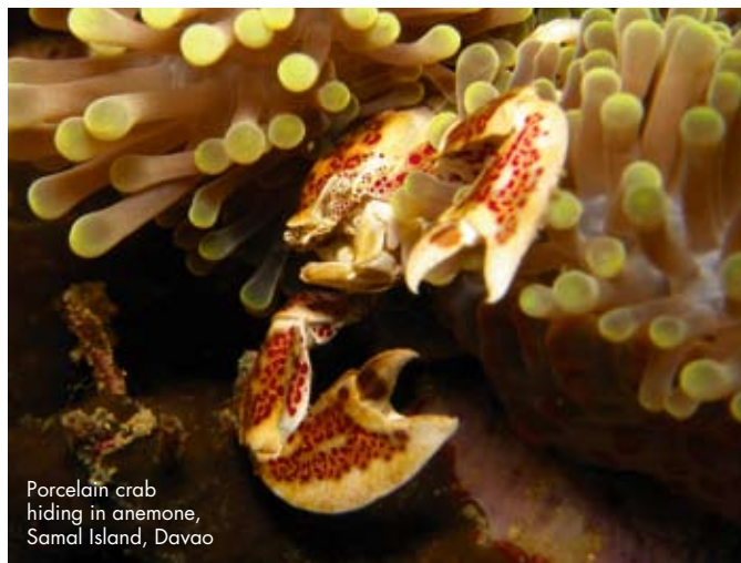
Porcelain crab hiding in anemone, Samal Island, Davao

2. Super Macro (Davao) Davao's dive sites have been subject to abuse by destructive fishing methods in the past. Many divers consider its dive sites mediocre, except for a couple in Talikud Island, which are washed by strong currents. However, avid underwater photographer Carlos Munda is out to prove that the most ignored sites usually offer rich rewards—he is now setting up Samal Underwater Photographers Resort (SUPER) to guide local and foreign photographers to sites that host rare macro creatures such as boxer crabs, frogfishes, harlequin shrimps, pygmy seahorses, wonderpus, coleman shrimps, and the rare ocellate octopus. He is still searching for the elusive blue-ring octopus.