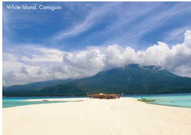
White Island, Camiguin

3. Camiguin Island and Medina Bay (Misamis Oriental) Camiguin is better known for its waterfalls, rock climbing, and white sandy beaches but there is also great diving here and in relatively unknown Medina Bay, Misamis Oriental, which is a ferry ride away. Most dive operators in the area such as the biggest, Johnny's Dive N' Fun, which operates mainly from Paras Beach Resort in Camiguin and Duka Bay Resort in Medina Bay, offer dive tours around Camiguin, Mantigue Island, and Medina Bay. The waters here are very clear and offer divers vistas of healthy corals, schools of jacks, pygmy seahorses, flathead crocodile fishes, nudibranchs, and coleman shrimps. Duka Bay also prides itself with dive shop owner Eddie Yap's patented reef rehabilitator, which are unique artificial reefs that speed up the rehabilitation of a damaged area from 20 years to just five to 10. It's been getting international recognition for its effectiveness in making damaged sites viable again.