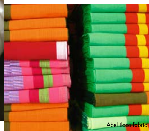
Abel iloco fabric

best pili in assorted flavors in the first and oldest pili house—once you get to Legaspi, you can ask anyone and they know where that old pili house is. There's a handicraft store in Gubat called Tony Co that exports native bags to the US and Europe. You can buy overruns with tags like Nine West, Esprit and Tommy Hilfiger still on them for as low as P250.