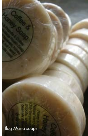
Ilog Maria soaps