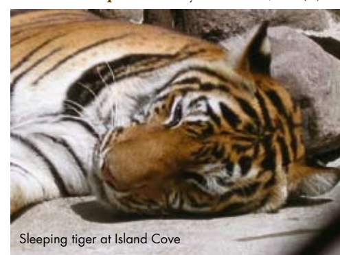
Sleeping tiger at Island Cove